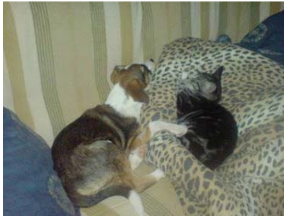
Who says cats and dogs don't get along?