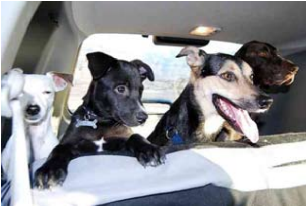
Otter and his new family

If you've been keeping up with Lady and her pups, you'll recognise these three bundles of joy. Coming from a litter of nine, Otter was used to being surrounded by other dogs. And it's a good thing too, because he shares his new home with three other canine companions, who were more than happy to welcome him into their pack. Candy and Abby were the last two pups to leave the foster nest, but the wait was more than worth it – both are happy settled in wonderful new homes, and Abby spends every night snuggled up in the bed with her new human brother.