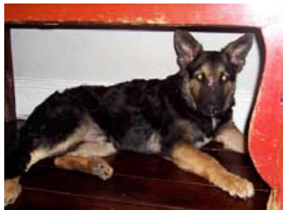
Rocket at rest