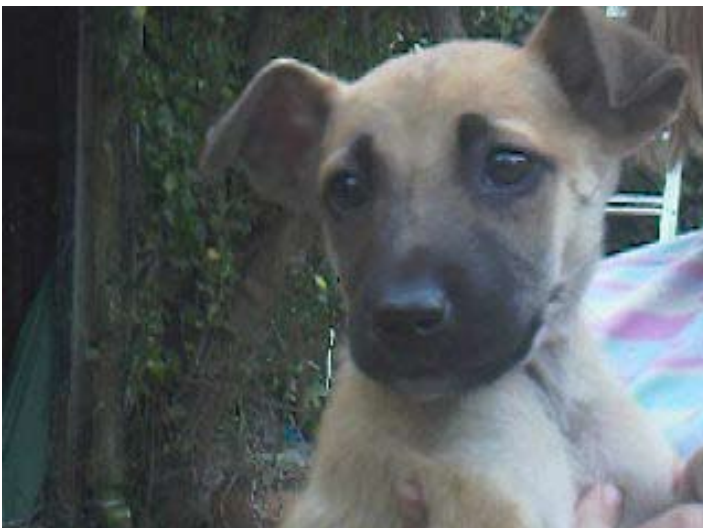
Murphy in his favourite place – in someone's arms

Murphy was found in Table View, and with his liquid brown eyes and heart-melting expression, a foster immediately whisked him off to her warm home in Observatory. Two weeks later, he found his perfect happy ending... in a home just a block away from the lady who originally found him! Just goes to show that sometimes you need to go full circle before you can find what you're really looking for.