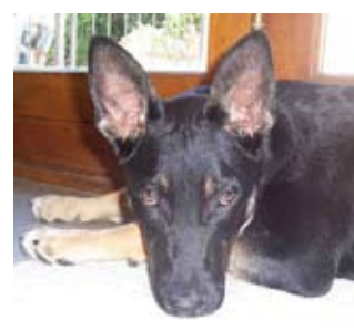
Rip enjoying an afternoon snooze