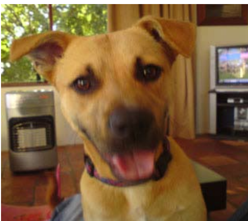
Ooh, a camera! I've never seen one of those before...

Cash was found wandering around Woodstock by an African Tails volunteer in May. He was about one year old, and had spent his whole life on his own, foraging for food in the fields and dumps. Initially, he was a little nervous, but within a week, he had come out of his shell and found the happy ending he deserved. According to his owner, "he's a super cool dog, very bright, learns very quickly, and already knows to sit before he gets his dinner. We LOVE him and he has fitted straight in as if he was always meant to be here!"