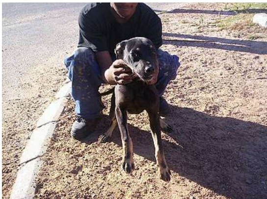
Blackie's original township photo

Blackie never needed foster care. Something about her special nature seemed to jump right out of her photo (taken before rescue while still in the township, as all of our foster homes were full) and into the heart of a wonderful woman who immediately took her in. And there this sweet, playful girl will stay for the rest of her lucky life, with 2007 African Tails graduate, Licorice, to show her the ways of the (first) world.