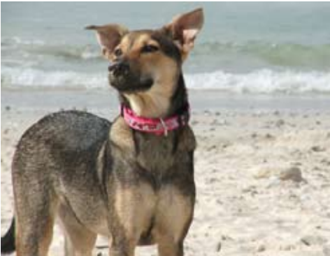
Ah! You don't get this fresh sea air in Du Noon!