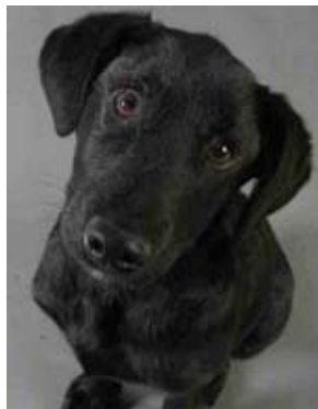
Licorice, Blackie's new brother