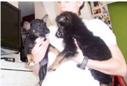
Brothers in arms